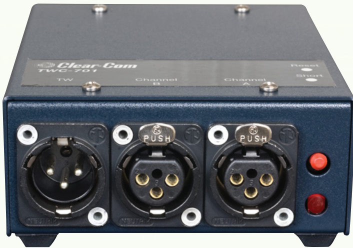
TWC-701 Front panel